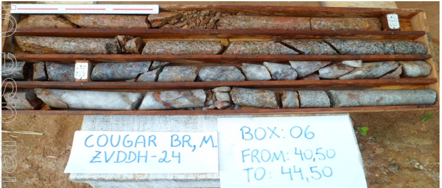
Figure 1: Drill core sample highlighting Pedra Branca Vein

The first drill hole (ZVDDH024) was commenced on 19 January 2012 and intersected a 1.26m wide vein at a vertical depth of approximately 37 metres (approximately 43 metres down-hole). The vein contains a 95cm wide band of quartz with visible gold and a 31cm wide band of disseminated to massive pyrite (refer to Figures 1 and 2 below).