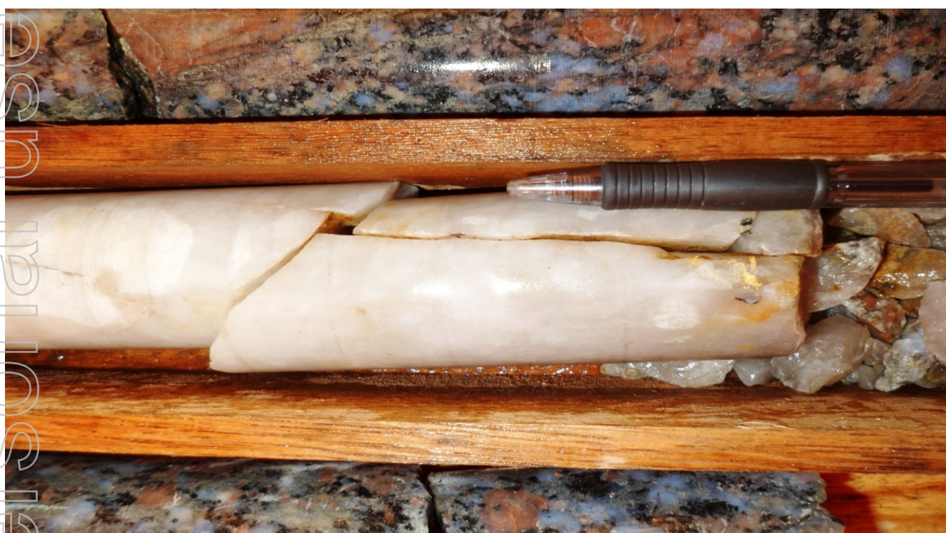
Figure 3: Visible gold filling narrow fractures in Drill Hole ZVDDH025

Drilling started on January 22 nd and intersected the vein at 49.46m down-hole. This intersection is 5.66m wide and consists of three quartz veins separated by narrow zones of mylonite and hydrothermally altered granite hosting disseminated pyrite. The upper quartz vein is 51cm wide and shows visible gold filling narrow fractures (see Figure 3 below). The middle vein is 18 cm wide and the lower vein is 20 cm wide (and contains approximately 3% pyrite).